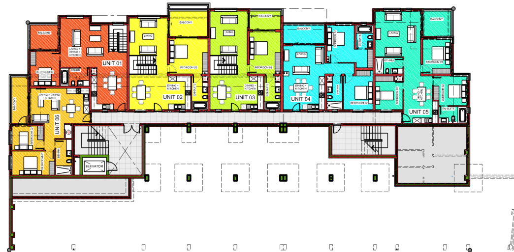
GROUND FLOOR PLAN N.T.S.