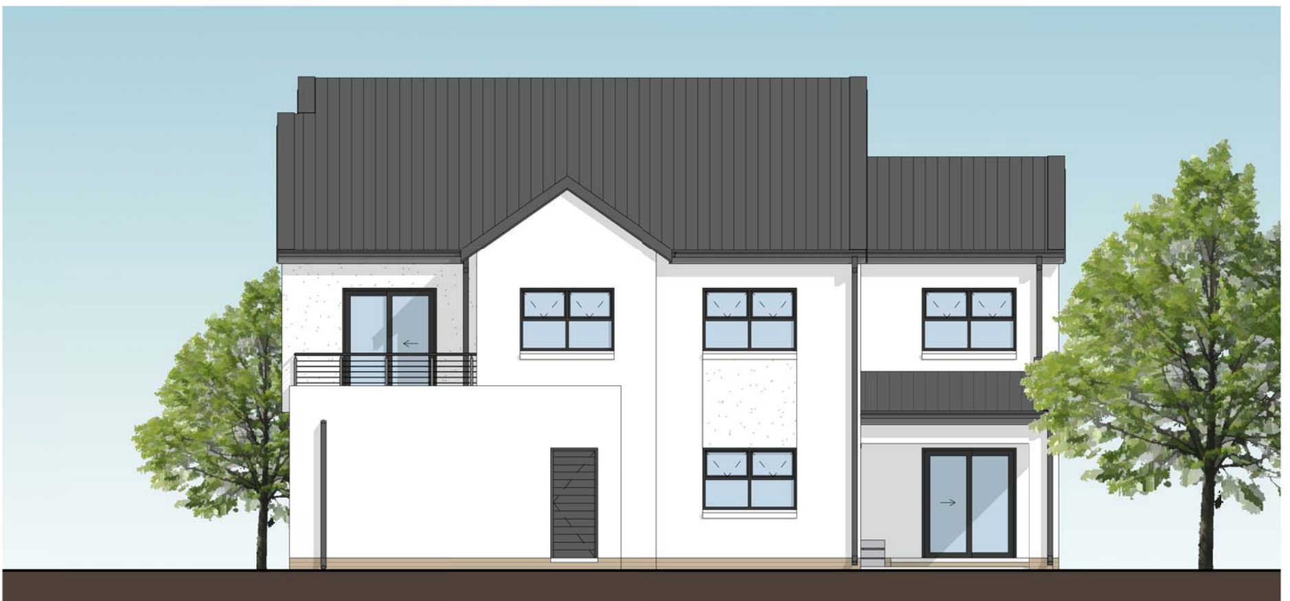
GARDEN ELEVATION SCALE 1 : 100 ON A3 PAGE