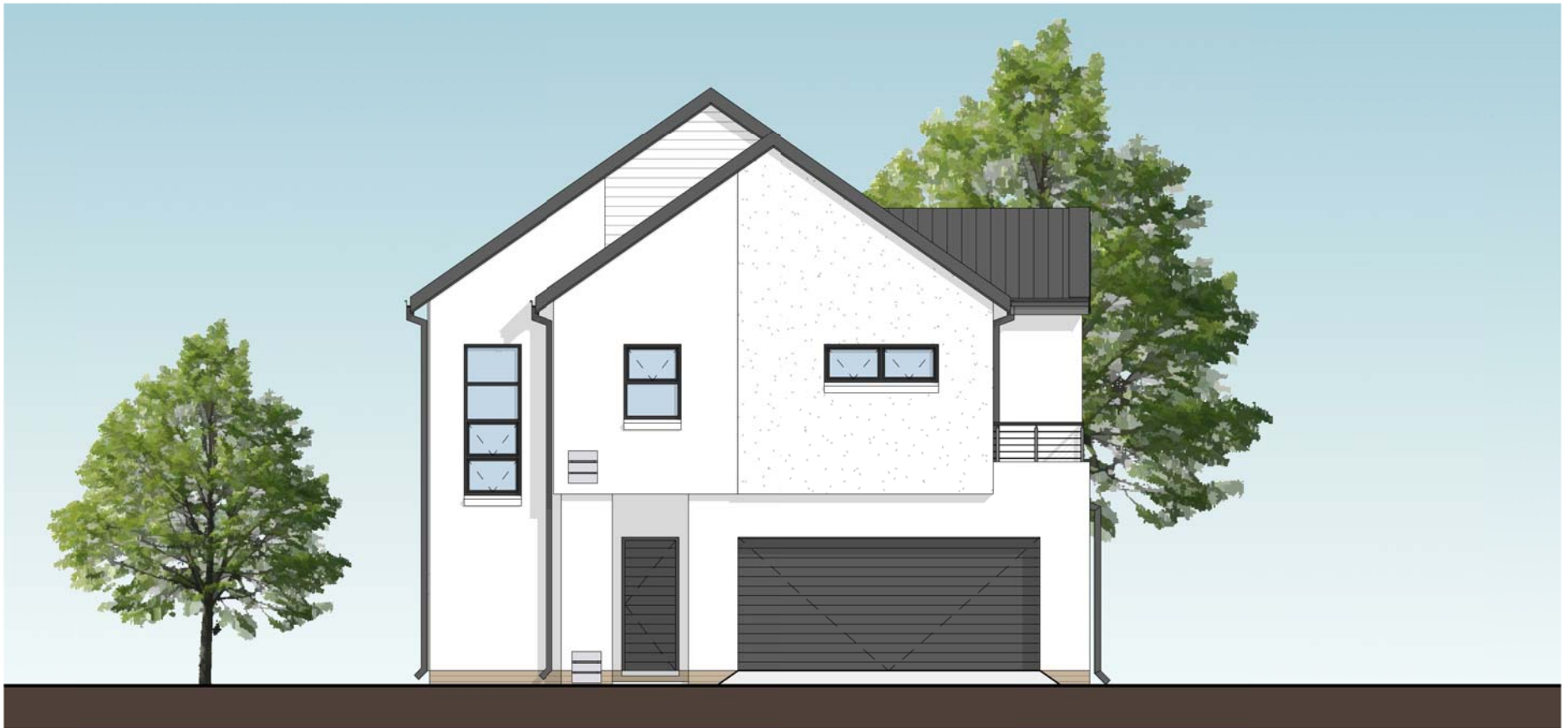
FRONT ELEVATION SCALE 1 : 100 ON A3 PAGE