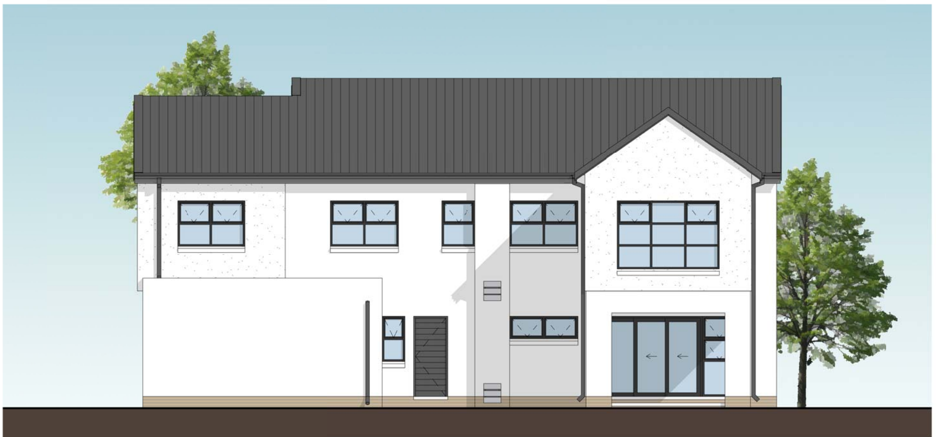
GARDEN ELEVATION SCALE 1 : 100 ON A3 PAGE