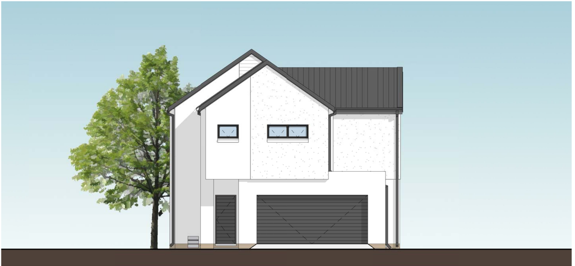
FRONT ELEVATION SCALE 1 : 100 ON A3 PAGE