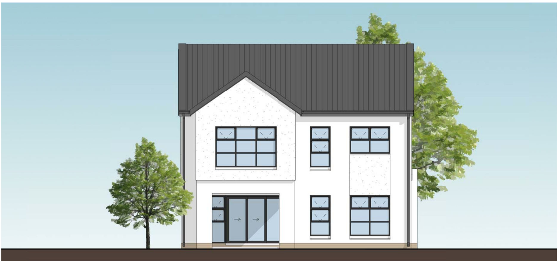
GARDEN ELEVATION SCALE 1 : 100 ON A3 PAGE