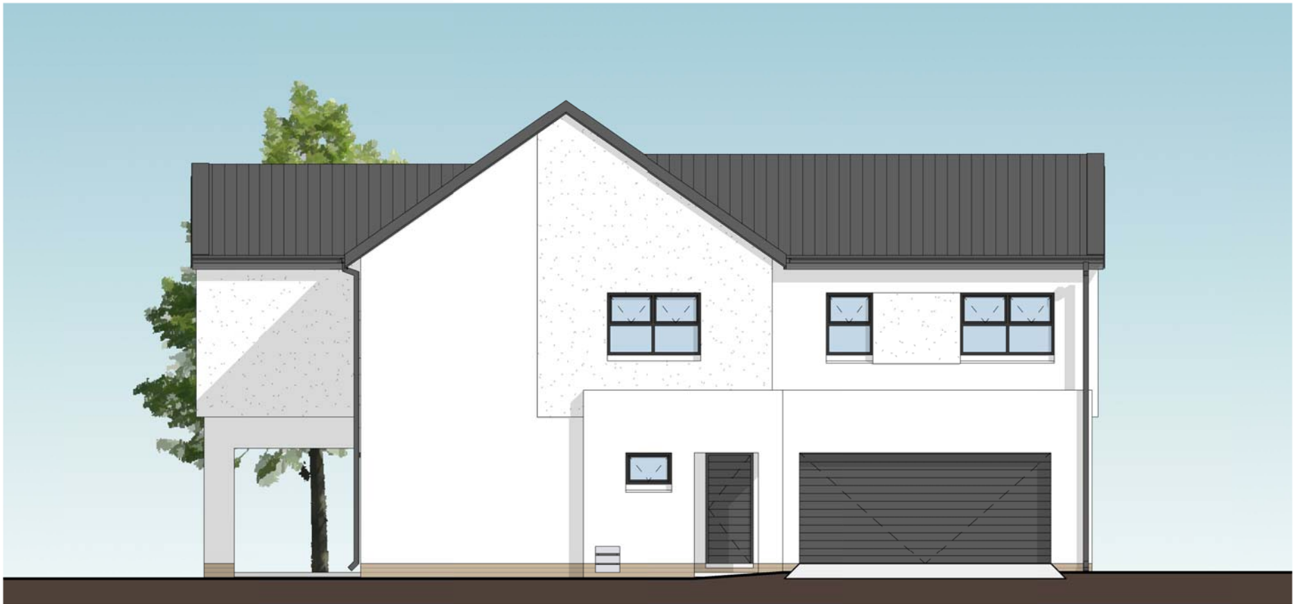
FRONT ELEVATION SCALE 1 : 100 ON A3 PAGE