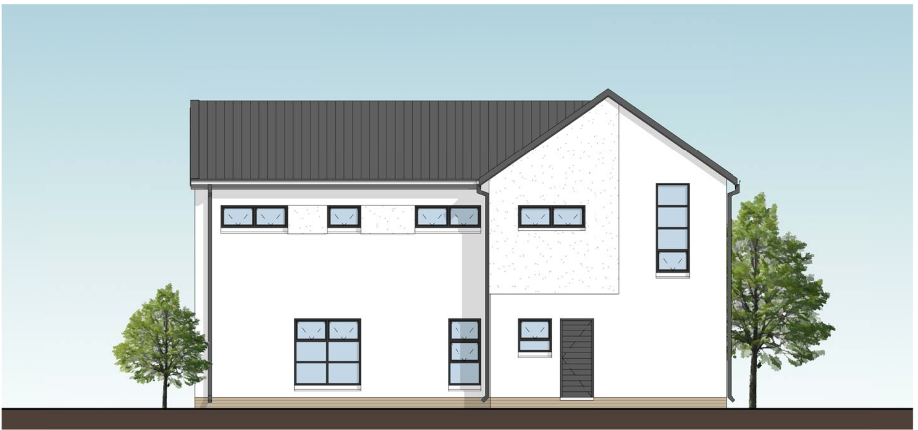
BACK ELEVATION SCALE 1 : 100 ON A3 PAGE