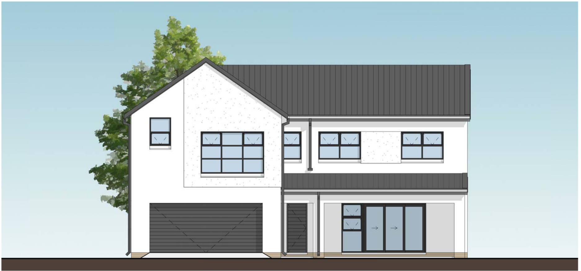
FRONT ELEVATION SCALE 1 : 100 ON A3 PAGE