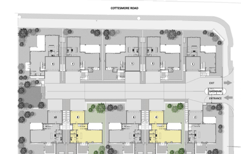
SITE PLAN 1:100