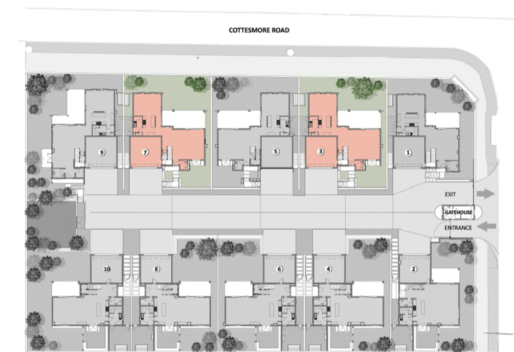
UNIT 07 & 09