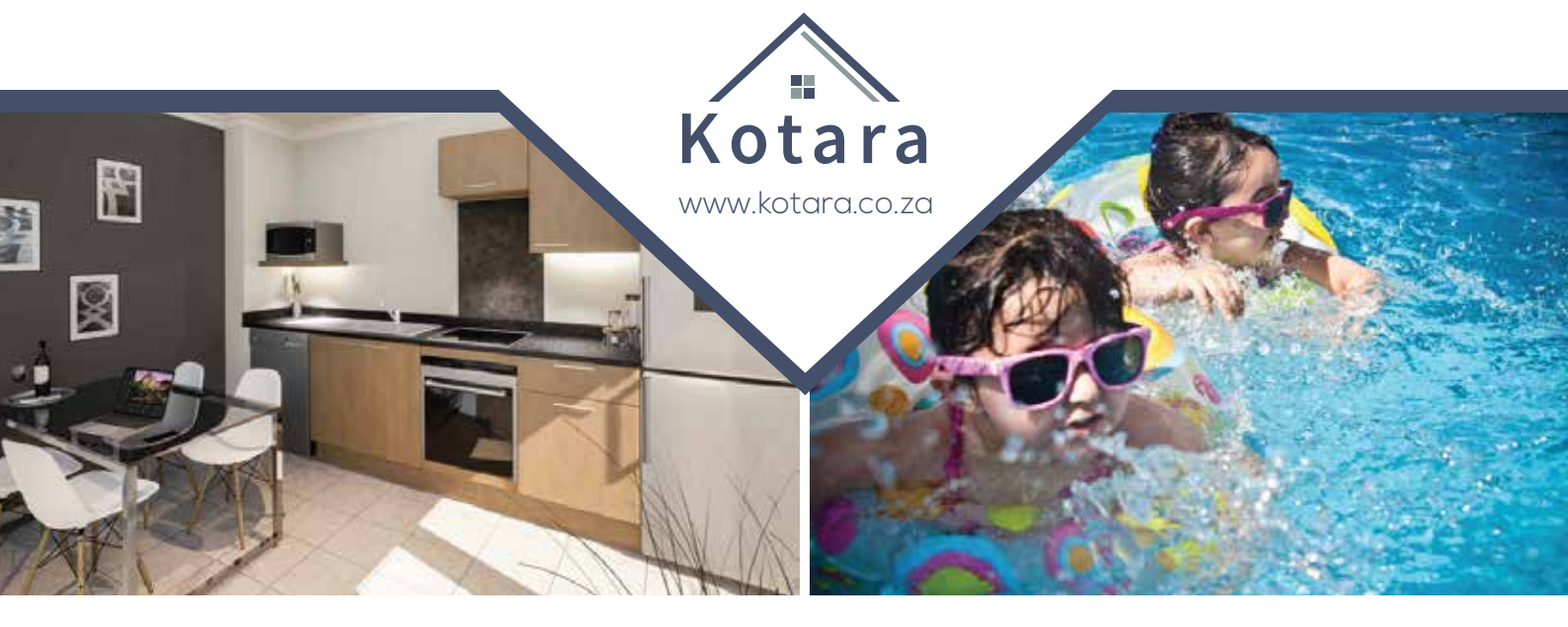
On show Saturday/Sunday/Wednesday 12pm - 5pm