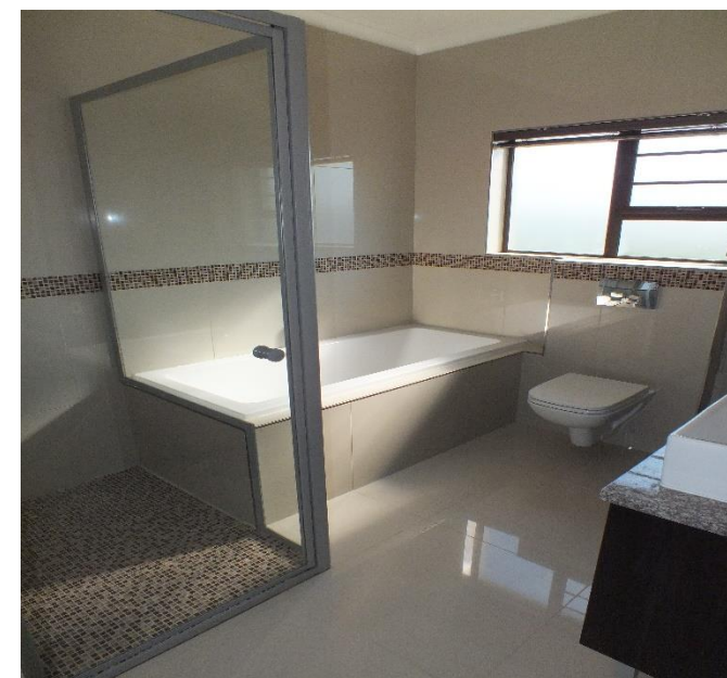
Bathroom tiled in full (extra cost)

Bathrooms: From floor to \pm 1.5 m high (level with window sills) STD