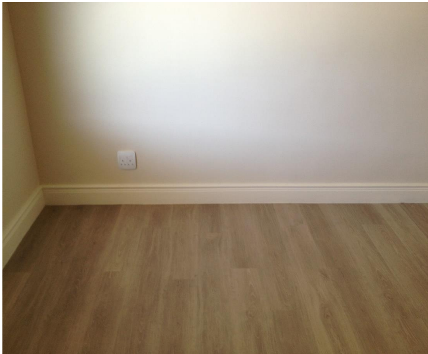
Ground Floor Internal/Bedrooms Option 1: Vinyl or Carpets