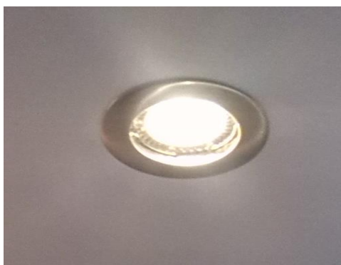
Downlighters: White or Satin Chrome: Bedrooms, Entrance, Dining, Kitchen (As per sample: option 1- white or 2-satin chrome)