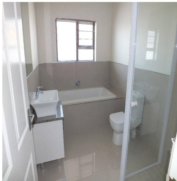
Bathroom halfway tiled and shower in full (STD)