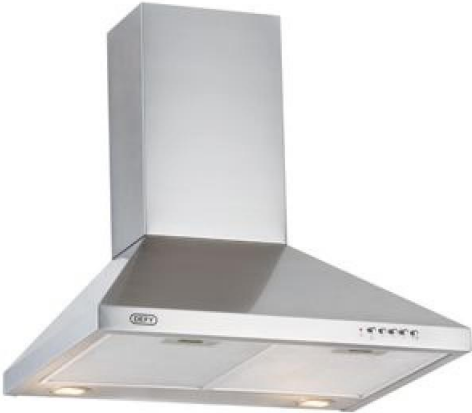
ELETTROMECC CHIMNEY EXTRACTOR STAINLESS STEEL