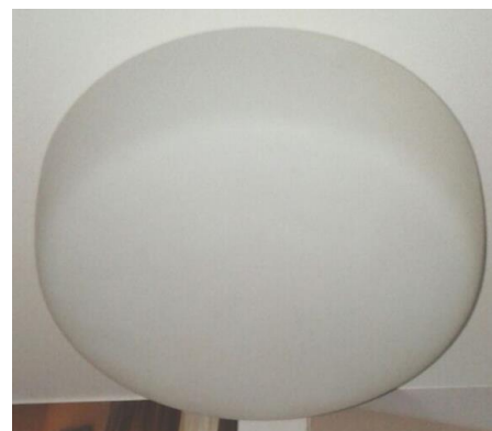
Ceiling Light (Cheese Cake): Bathrooms (As per sample)