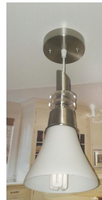
Pendant Lights at Kitchen Island (As per sample: option 1 or 2)