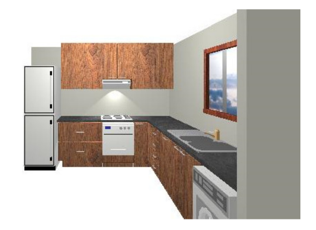
TYPE A TYPE B & D