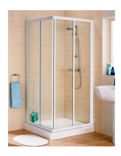
SHOWER DOOR - CORNER ENTRY