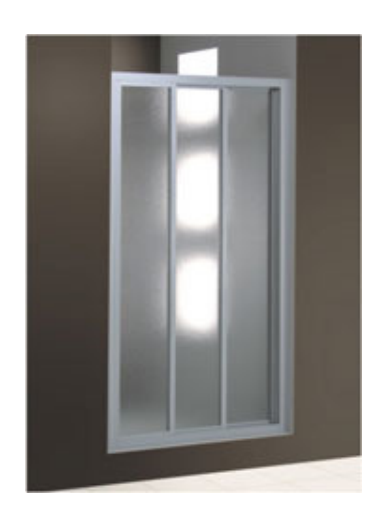
SHOWER DOOR - 3 PANEL