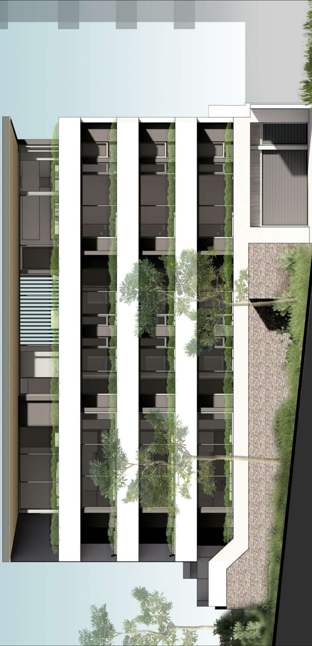
26 De Longueville | North Elevation