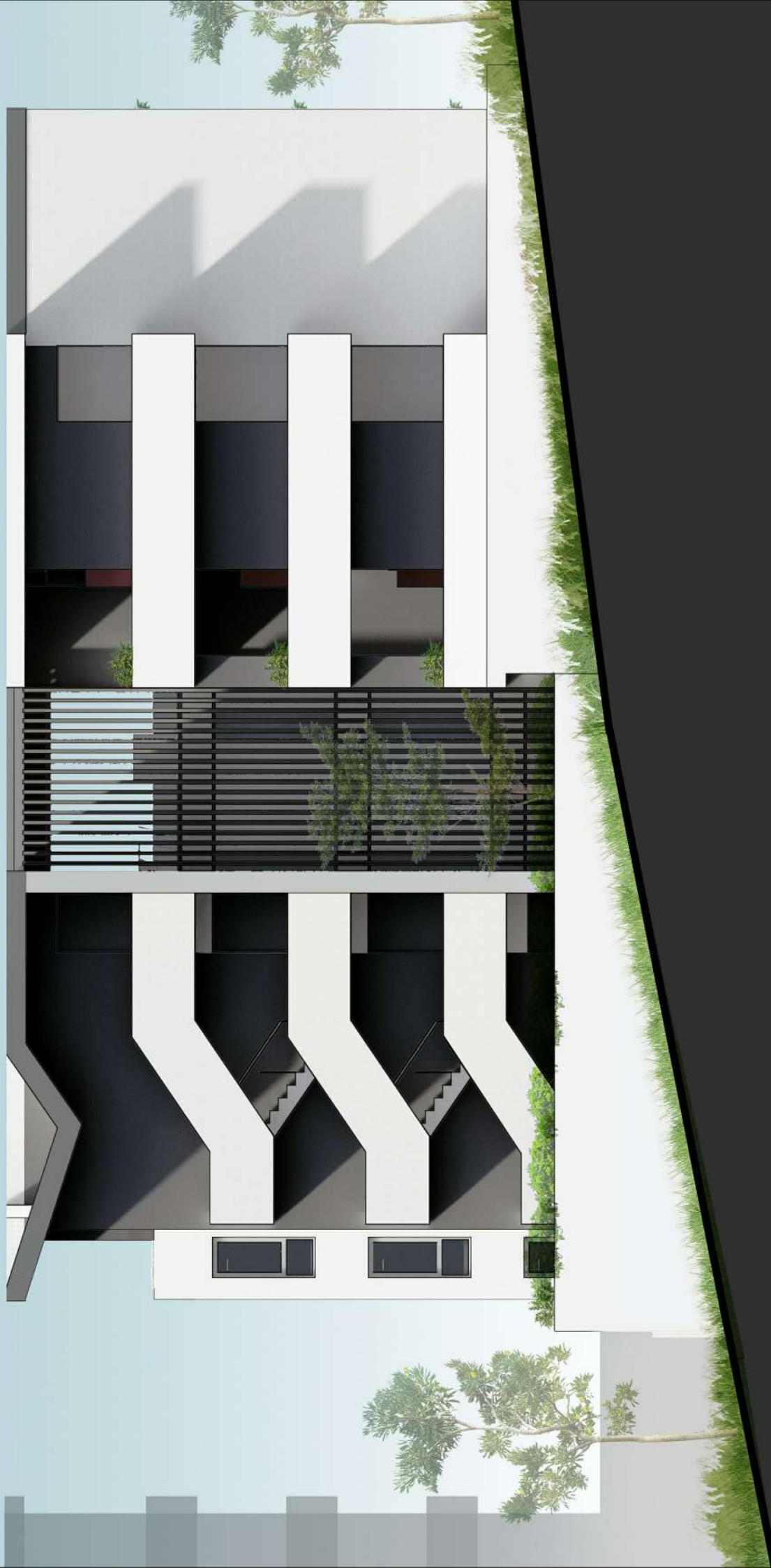
26 De Longueville | South Elevation