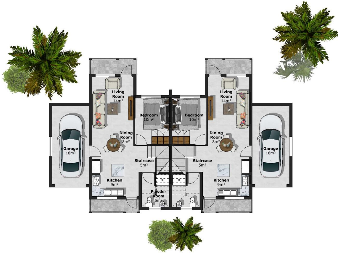
GROUND FLOORPLAN scale 1:100