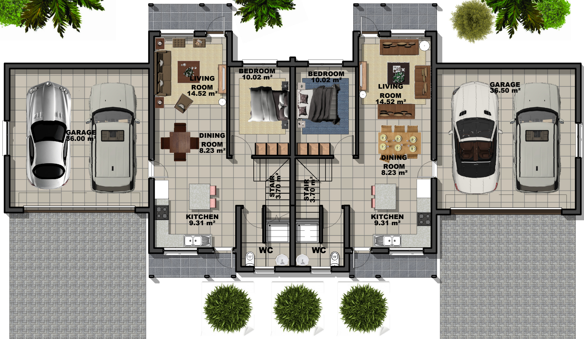
GROUND FLOOR PLAN 1 : 100